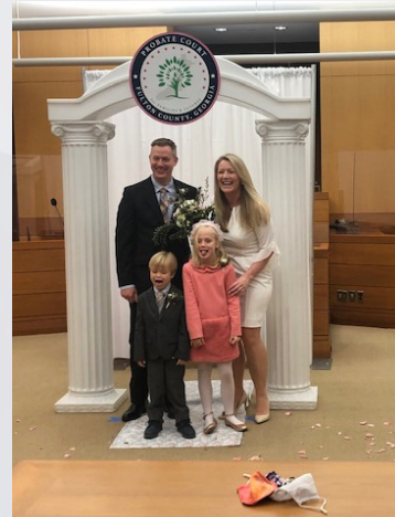
Valentine's Day Weddings at the Courthouse