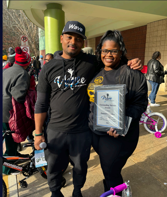
OUTSTANDING SERVICE AWARD WAVE