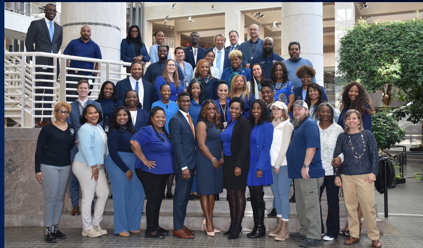
Standing united against human trafficking! Members of the Fulton County District Attorney's Office stood in solidarity while donning shades of blue to raise awareness on Human Trafficking Awareness Day. Together, we can make a meaningful difference.