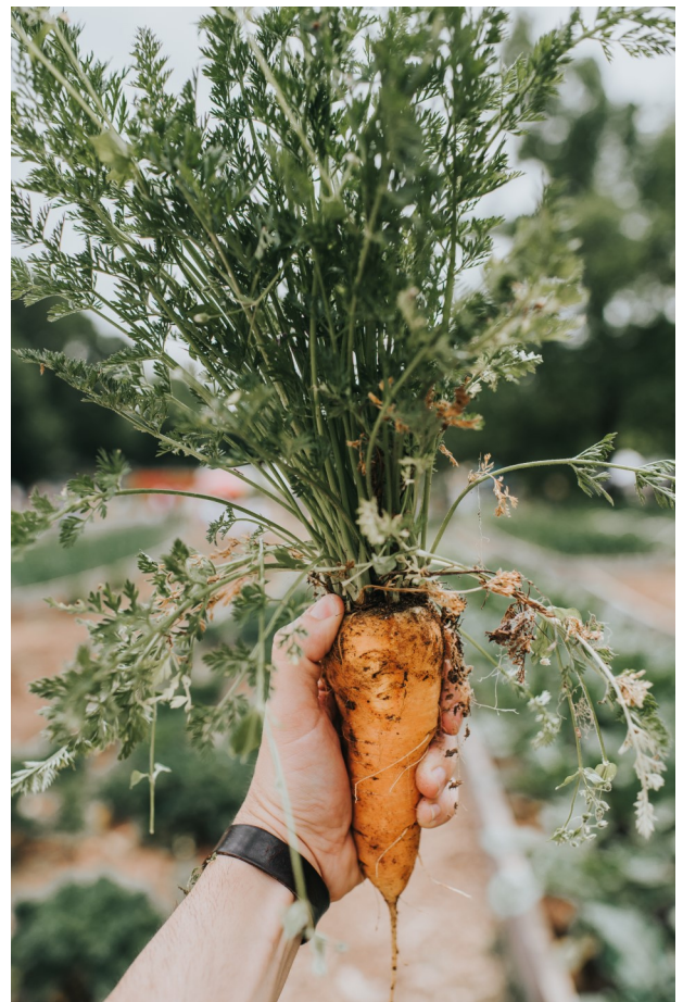
Food Well Alliance Annual Soil Festival

A soil contaminant is an element or chemical present in the soil at a level that could possibly pose health risks. While some contaminants are naturally-occurring, in many cases, human activities have increased the levels of many elements and chemicals in soil. Lead, cadmium, arsenic, zinc, and polycyclic aromatic hydrocarbons (PAHs) are examples of contaminants commonly found in any urban environment.